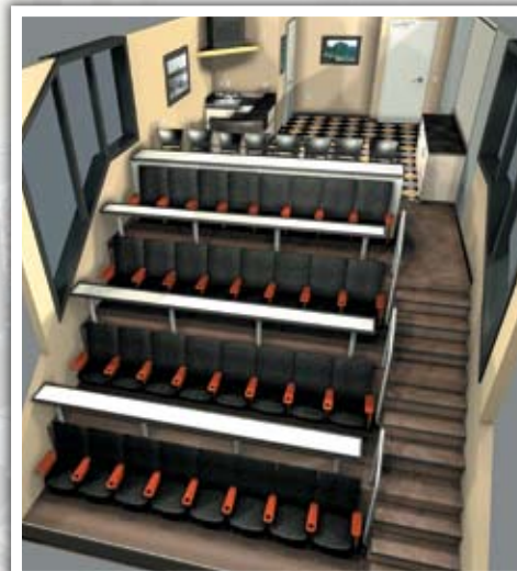
Superstretch Suite Layout